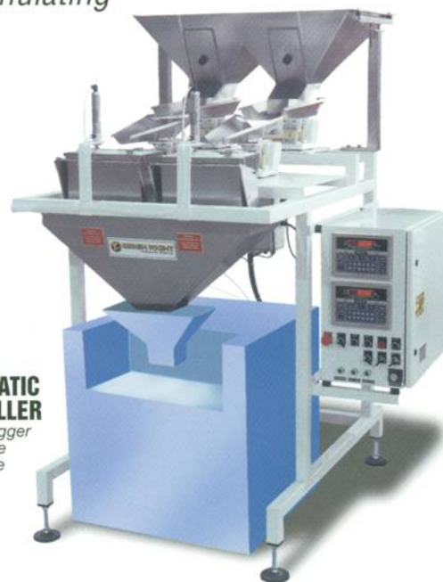
PMB-2 FULLY-AUTOMATIC NET WEIGH FILLER With optional bagger of your choice shown in blue

Look to Weigh Right for infeed conveyors, automatic indexing conveyors and unscrambling and accumulating tables.