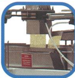
PMB-2FL Shown with optional gravity feed system

Adding this system can increase production by as much as 50%, dispensing the bulk of your free flowing product directly into the weigh bucket. When the target weight is close, the FL gate closes and the vibratory feed accurately completes the fill.