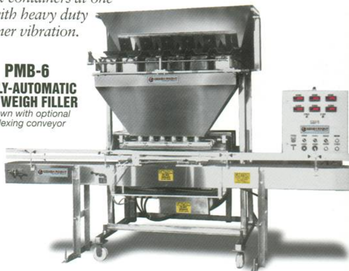
PMB-6 FULLY-AUTOMATIC NET WEIGH FILLER Shown with optional indexing conveyor

Fills six containers at one time with heavy duty container vibration.