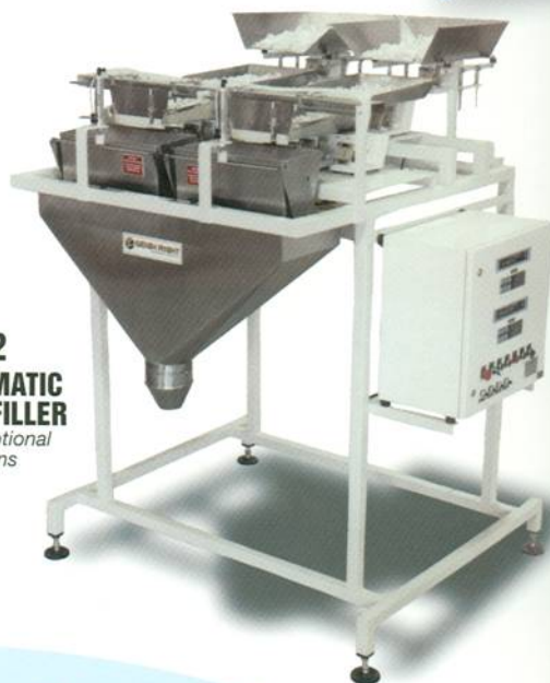
PMB-2 SEMI-AUTOMATIC NET WEIGH FILLER Shown with optional transfer pans